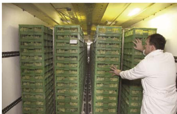
Transport chicks in a well climatized truck.

Stressful factors during transport can be loading and unloading, duration of the trip, air speed, humidity, shocks and vibrations and noise. Most important, however, is the temperature, since bird response to non-